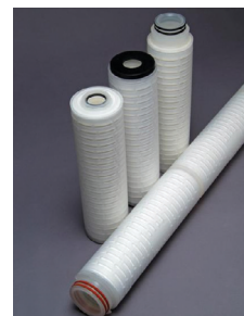
Figure 2 – Critical Process Filtration’s pleated membrane filters are used for bacteria removal.

Contact Critical Process Filtration for help determining the best filter options for you.