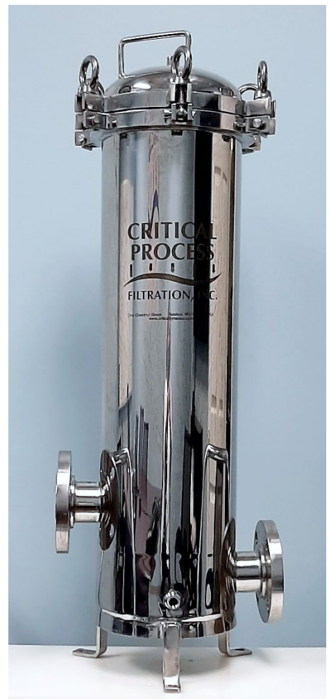
4- to 80-Round Industrial Housings Nominal Lengths – 10 in. to 40 in.