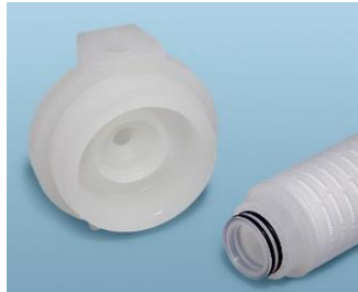
2-222 SOE Style, Optional