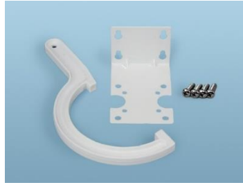
CHPN Half Sump Wrench