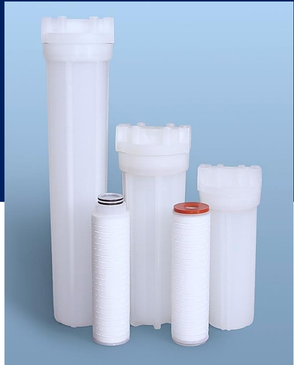
CHPN Polypropylene Housings Nominal Lengths – 10 in. and 20 in.

CHPN housings are made with 100% high purity polypropylene for wide chemical compatibility and low extractables. The rugged design has been tested up to 150,000 pressure cycles to 125 psi and passes a 500-psi burst test to ensure safe operation up to 100 psi. CHPN housings are available with connections to hold 10- or 20-inch filter cartridges with 2-222 SOE or DOE configurations.