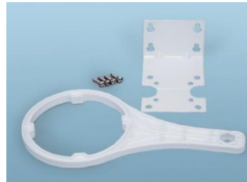
CHPN Sump Wrench – DOE 10" only